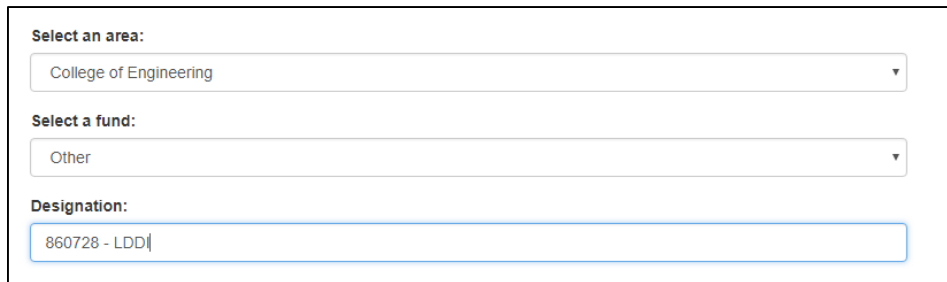
Step 3: Enter 860728 – LDDI in the “Designation” field

Donations made to LDDI through the Virginia Tech Foundation are tax deductible.